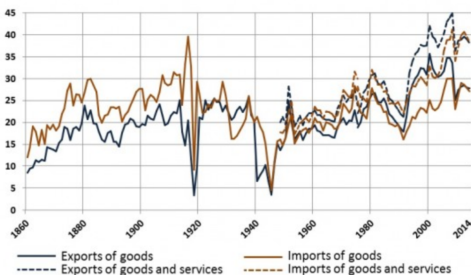
Table 1. Finnish Foreign Trade, 1860–2014, per cent to GDP

Sources: Ritta Hjerpe, Finland's Historical National Accounts, 1860–1994 (1996); Reino Airikkala & Tuomas Sukselainen (ed.), Suomen maksutaseen kehityslinjat vuosina 1950–1974 (1976); Jarmo Kariluoto, Suomen maksutase (...) 1975–92 (1995); Suomen Pankki, Suomen maksutase 1993–2002 (2003); Tilastokeskuksen PX-Web-tietokannat, http://pxnet2.stat.fi/PXWeb/pxweb/fi/StatFin/ (25.12.2015)